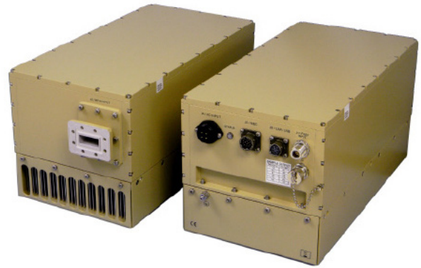
CPI 30/50 W GaAs X-band BUCs, Models UB61050, shown here with rear and front views

Backed by over 40 years of satellite communications experience, and CPI's worldwide 24-hour customer support network that includes more than 20 regional factory service centers.