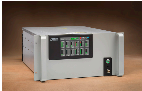
CPI 1250 W Ku-band TouchPower™ TWTA Model T5UI-12